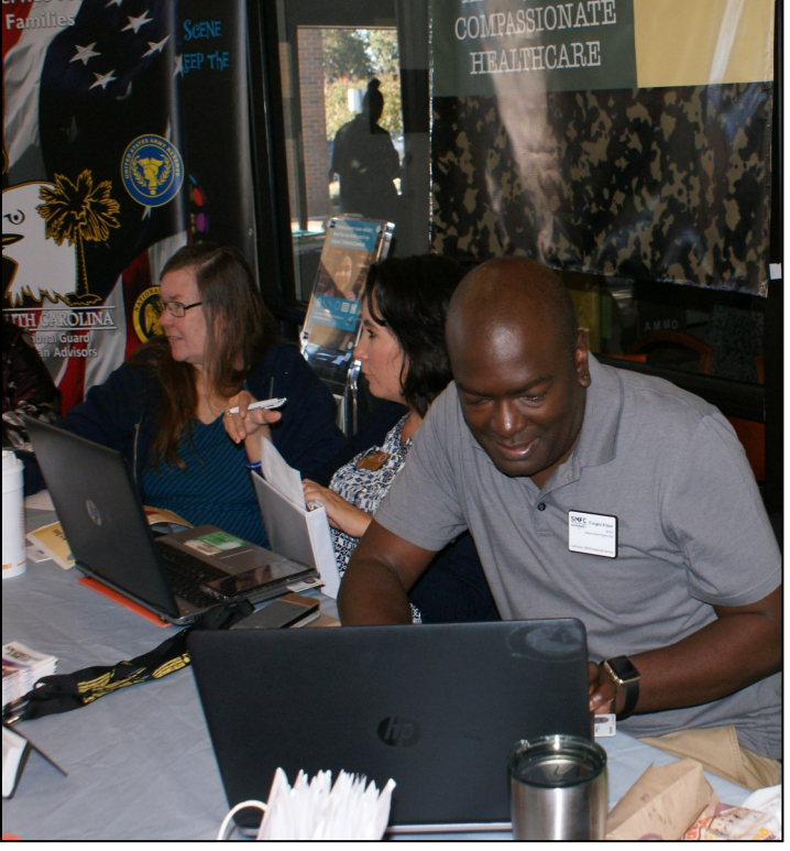
The CareFIRST Carolina Foundation and Care-South Carolina held the inaugural "Stand Up For Veterans" event on Nov. 17 in Hartsville. Veterans from throughout the region were provided medical and dental care. A variety of veteranrelated organizations also participated by providing information and services.

cal and dental care at no cost to local veterans to honor their service and expedite needed care. Services provided by the medical staff included blood sugar testing, oxygen level testing, blood pressure reading and hemoglobin (HA1C) screening. Eye exams and foot exams were provided by the Hartsville Lions Club and Physicians Foot Care, respectively. Dental services, provided on board the Love Mobile Dental Unit, evaluat-