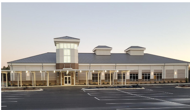
CareSouth Carolina Cheraw is now located at 812 State Road, Cheraw, SC

CareSouth Carolina is excited to announce the opening of its all-new state-of-the-art facility in Cheraw. The new facility, located at 812 State Road Cheraw, is now welcoming patients.