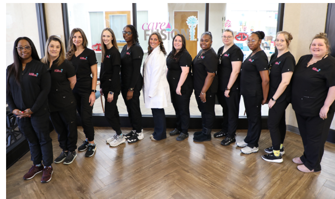
CareSouth Carolina CareFusion Department