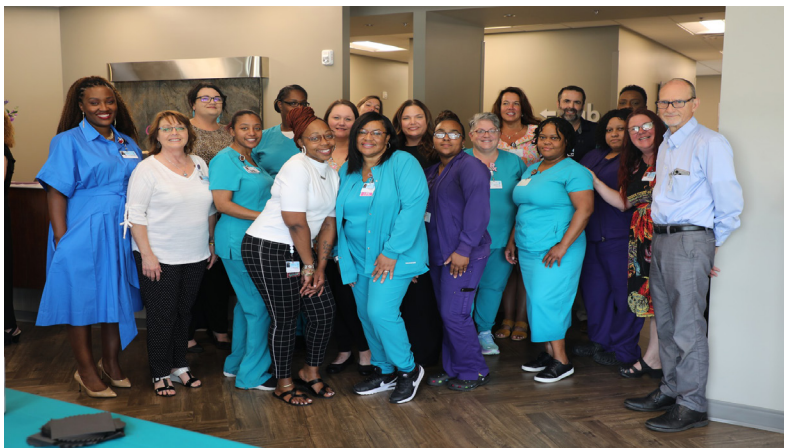
CareSouth Carolina Cheraw staff enjoyed being a part of this milestone event.

To make an appointment at our Cheraw office, please call 843.537.0961 or for a Podiatrist appointment, please call 843.921.6711. New Patients are welcome!