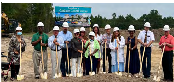
Cheraw Center Ribbon Cutting - August 25, 2022

Representatives from CareSouth Carolina as well as community leaders gathered on August 25, 2022, at noon to celebrate a groundbreaking ceremony for its newest facility.