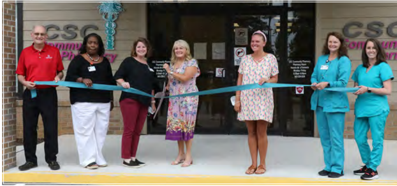
CSC Community Pharmacy Hartsville Ribbon Cutting - August 11, 2022

CareSouth Carolina and CSC Community Pharmacy hosted a Ribbon Cutting ceremony to celebrate the opening of the Hartsville location's pharmacy at noon on August 11, 2022. The pharmacy, located at 1268 South Fourth Street in Hartsville, opened its doors in June of 2020, but a celebration was delayed because of COVID restrictions.