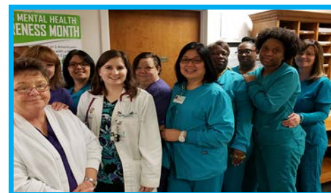
CareSouth Carolina Bennettsville Pediatric Unit

CareSouth Carolina has pediatric sites in Bishopville, Bennettsville and Hartsville.